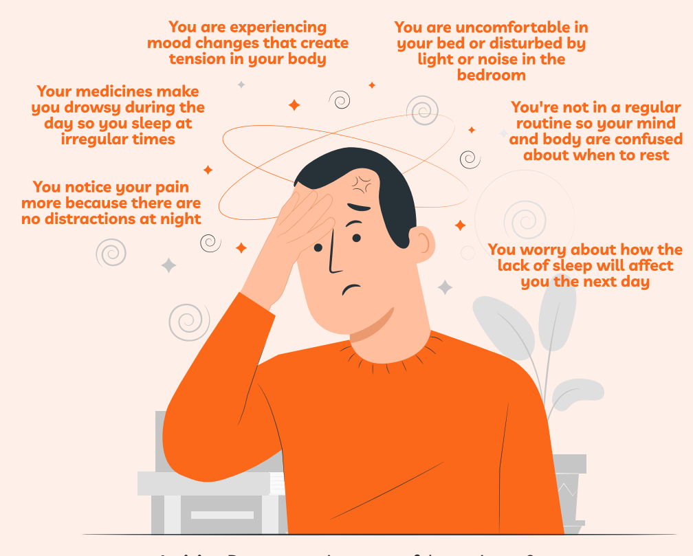
Activity: Do you experience any of these triggers? Circle the ones that affect you.

It's likely that there are a number of causes of your sleep difficulties. Here are six triggers often found by people living with pain: